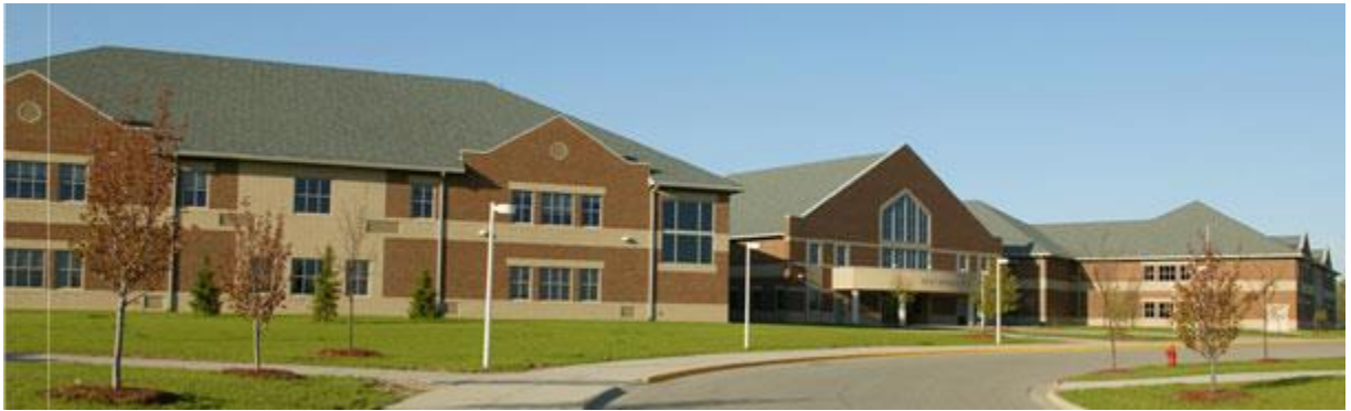
Holt High School – Main Campus 5885 W. Holt Road, Holt, MI 48842