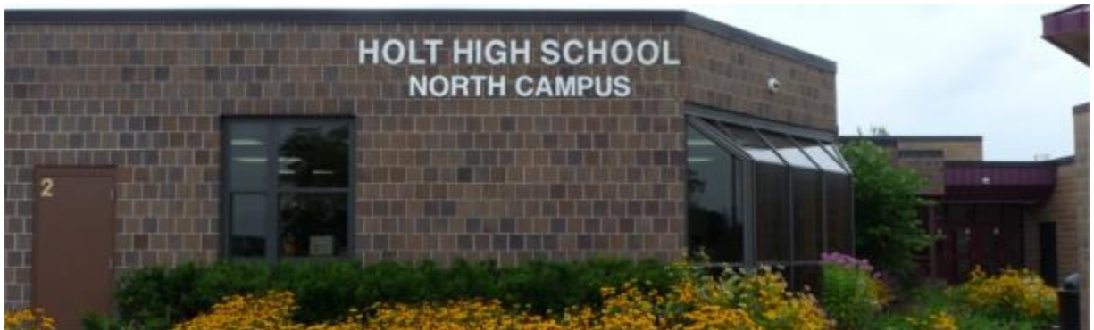
Holt High School - North Campus 5780 W. Holt Road, Holt, MI 48842